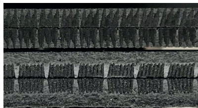
Slot-bridge pattern and hinge