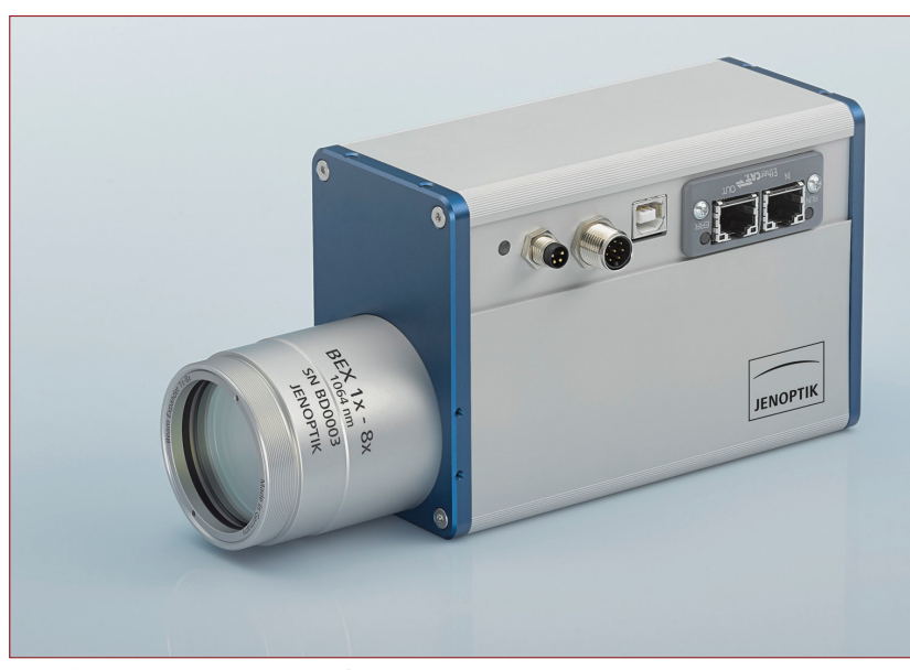
Motorized Beam Expander 1x – 8x

As an established OEM partner in the photonics sector, Jenoptik digitizes and integrates customerspecific optical systems. And with the market launch of a motorized beam expander, the company is also broadening its focus to include the digitization of standard products for laser production systems. The motorized expander is based on