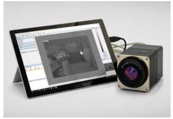
Blackbird infrared camera with tethered tablet PC

Blackbird precison thermal monitoring kit provides a mobile all-in-one solution for versatile application.